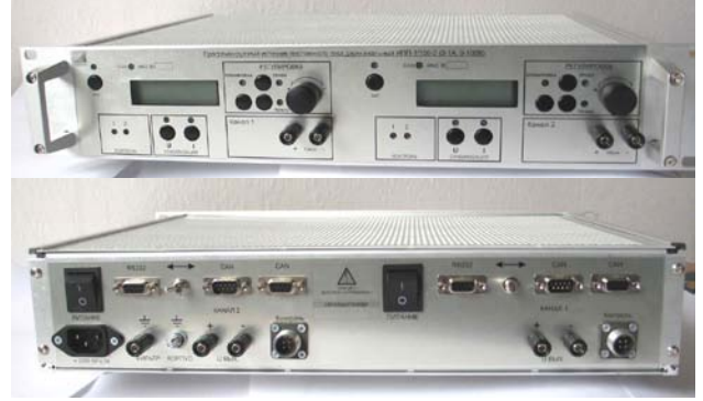
Fig.1. Power supply "Marathon IPP-1/100" – 2 channels, front and rear view.

Advanced front panel with LCD indicator and digital encoder gives access to all features of the power supply in manual mode.